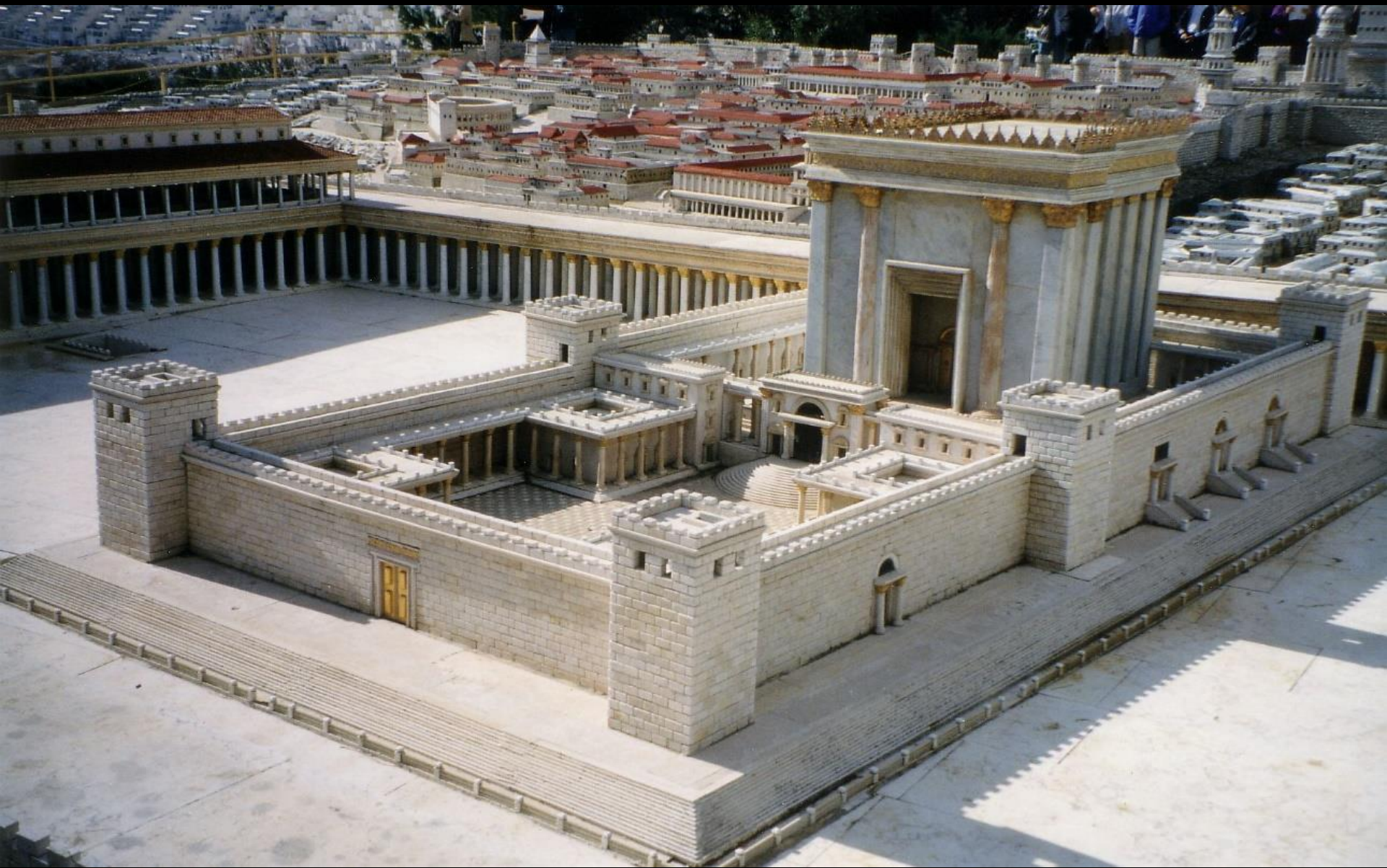
Second Temple built by Herod the Great