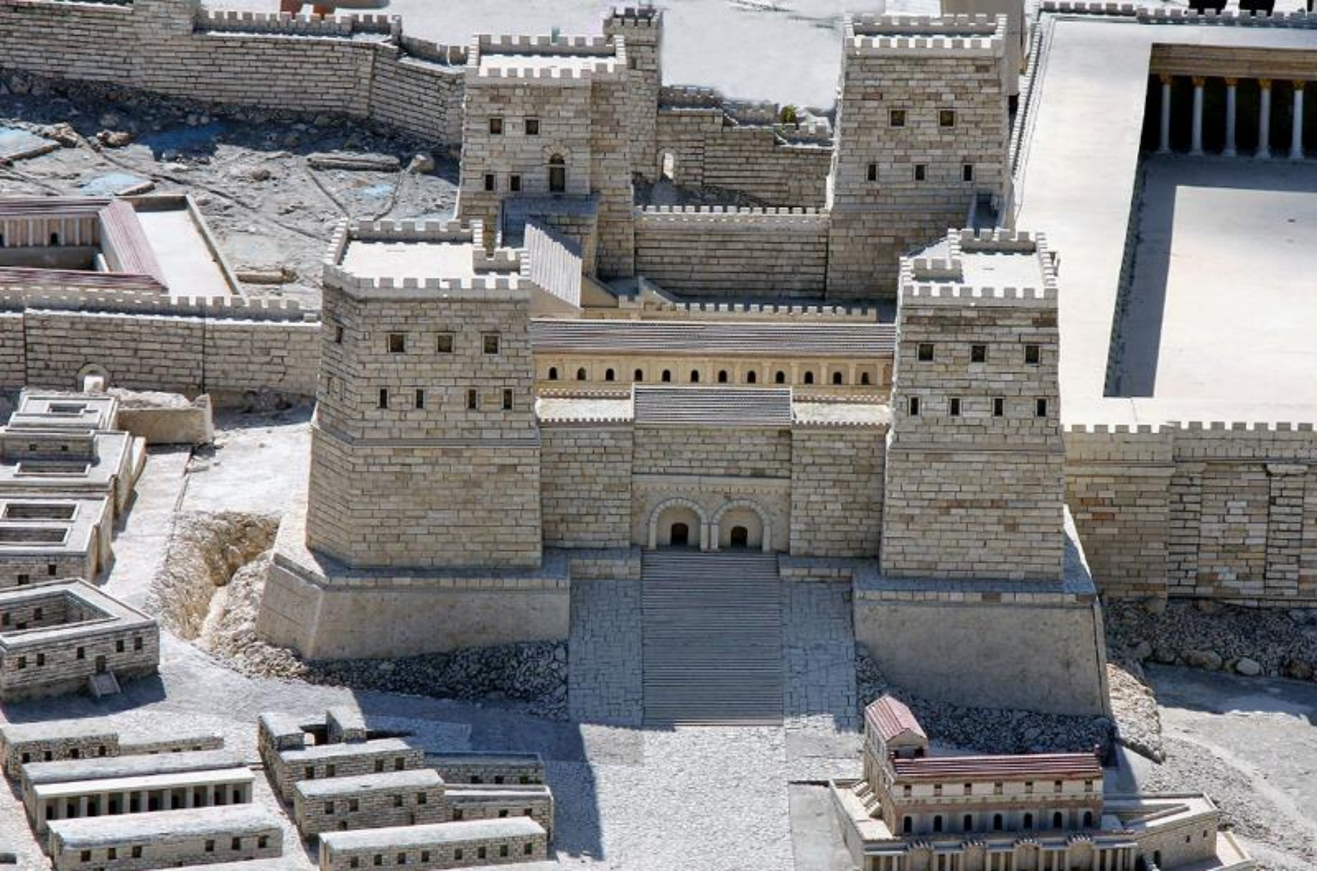
Antonia Fortress (military barracks at Eastern gate)