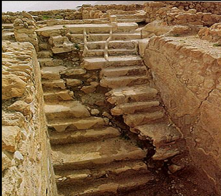
1st Century Qumran (Dead Sea) Miqvots