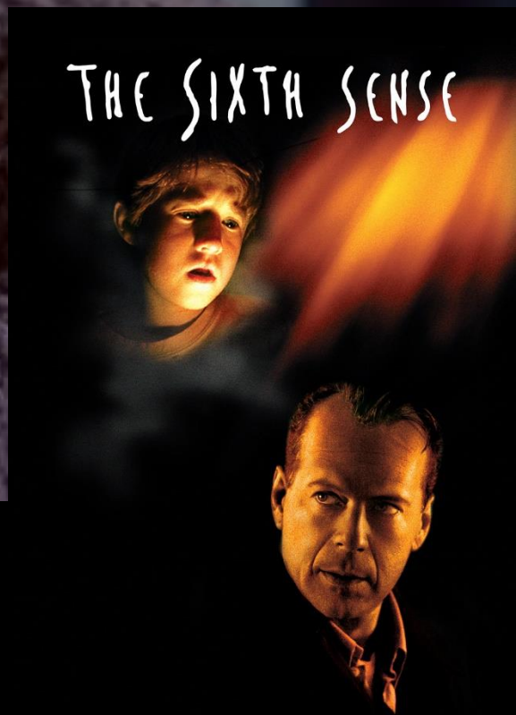
The Sixth Sense (1999) M. Night Shyamalan